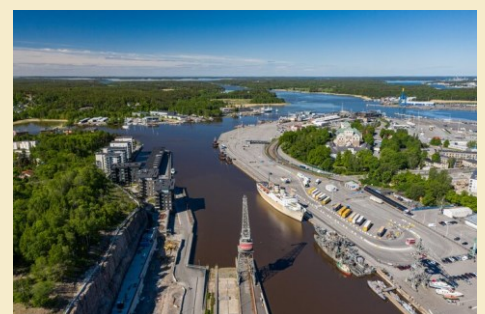
Figure 2 Räsänen, H./Turku City 2022

https://mediapankki.turku.fi/sharing/product/935ace1e7ef2406d?lang=fi