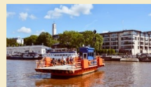
Figure 18 Taponen, H./Turku City 2024