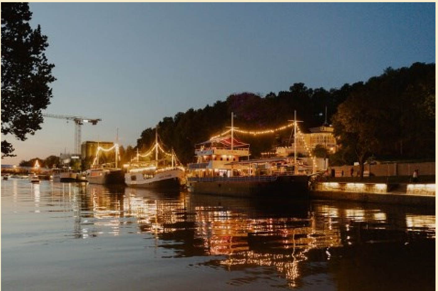
Figure 1 Vill Media Oy/Turku City 2024

Walking increases serotonin, endorphin and dopamine, which are hormones that make you feel good, boost your immune system and improve your physical and mental well-being. Go with a new or old friend to add a social dimension. It is also a great way to see new places. Even a short walk has positive effects, so you can try just one of these walks or only a shorter section.