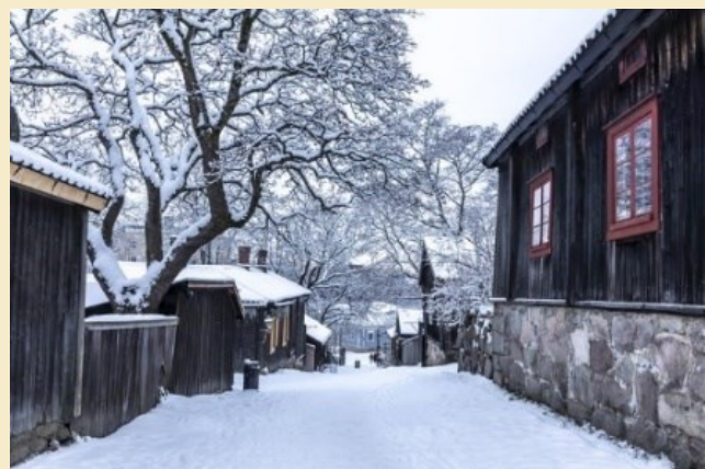
Figure 6 Närhi, R./Turku City 2022