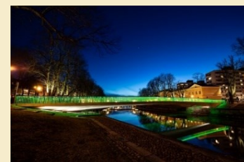
Figure 10