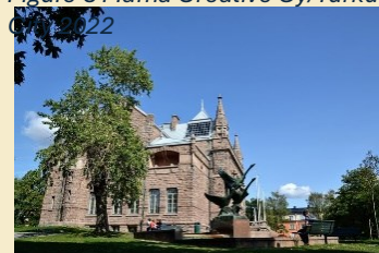
Figure 9 Pulli, P./Turku City 2020