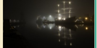
Figure 16 Mäki, T./Turku City 2028