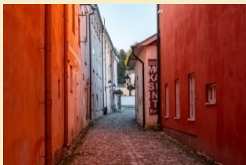
Figure 5 Visit Turku Archipelago