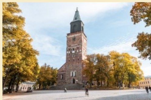
Figure 2 Visit Turku Archipelago