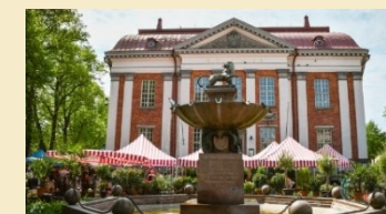
Figure 11 Kantola, C./Turku City