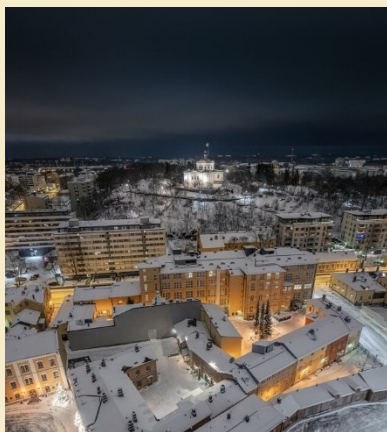
Figure 7 Kurkilahti, M./Turku City 2021

If you start from the Kakola Hotel, you can enjoy the riverbank, skip the market square and head right to Vartiovuori. This will take more time (56 min, 3,9 km) https://maps.app.goo.gl/eKgU3tV4JcRpVmkG8