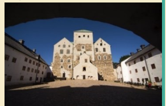
Figure 15 Liina alho, J./Turku City