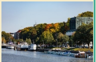
Figure 13 Räisänen, H./Turku City 2020