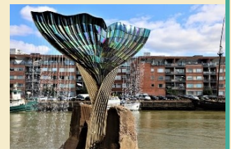
Figure 12

Samppalinnan puisto (Samppalinna Park) with nice town views. If the stairs up this hill are a problem, you can just skip this section and walk along the river. Info in Finnish: Samppalinnanpuisto | Turku.fi