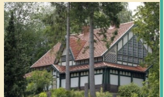
Figure 14